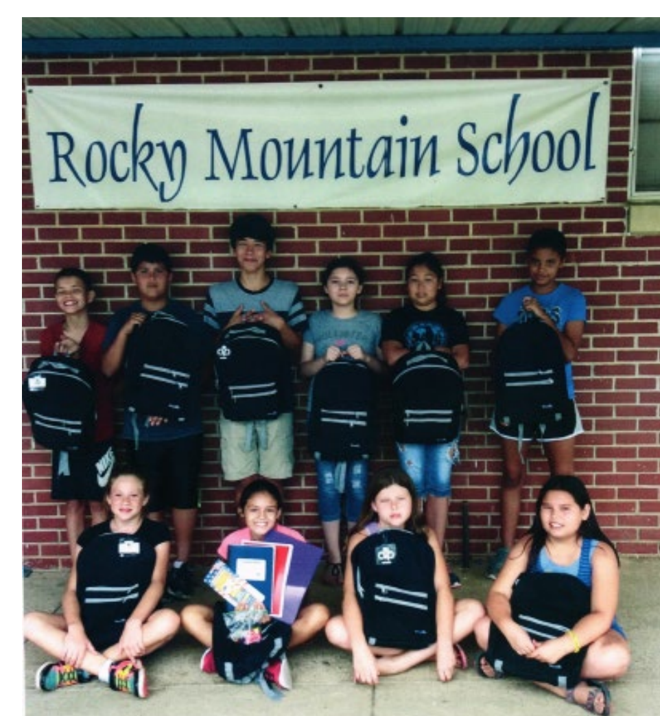
Figure 1. Cherokee Nation (Oklahoma).