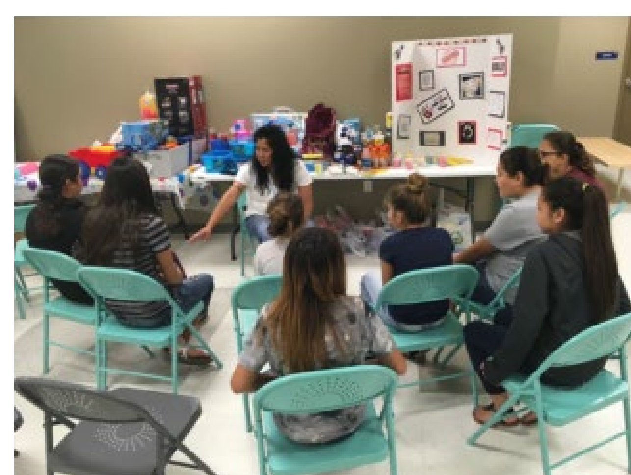
Figure 3. Spirit Lake Nation (North Dakota).