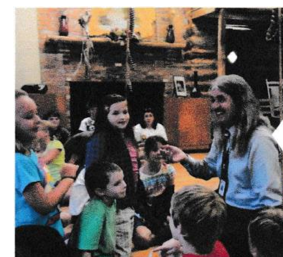
Figure 2. Catawaba Indian Nation (South Carolina)