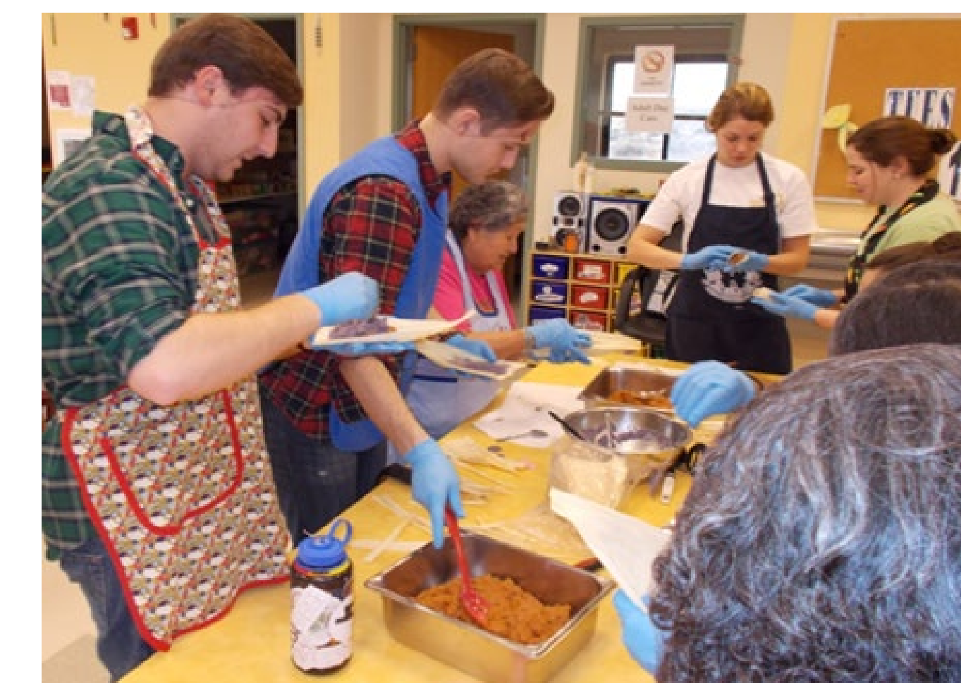
Figure 4. Pueblo of Zuni (New Mexico).